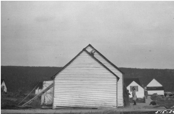
Rigolet, Labrador

What does the site commemorate? Why did the Newfoundland Regiment earn such special recognition? Why is John Shiwak's contribution significant to the overall contribution of Newfoundlanders and Canadians during the First World War?